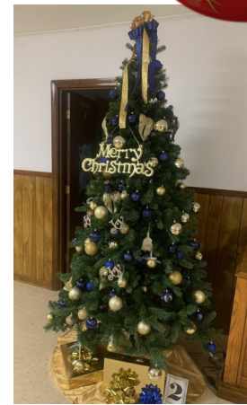
Public Relations Committee