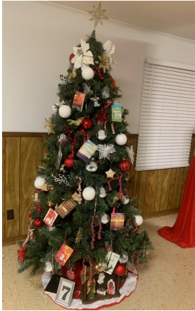
Ministerial Ministry 1st Place

Ministries showcase various themes on their Christmas trees.