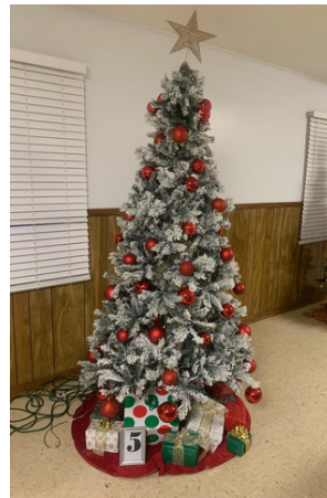
Senior Missionary Ministry 3rd Place