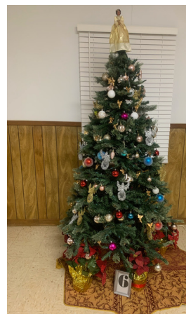
Angel Tree Ministry