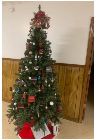
Choir Ministry 2nd Place